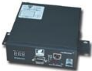
Mounting Brackets (RM1UB, Optional Parts)

Security - Accessing the system is password protected at Administration level or user privilege levels. Network security includes user name and password authentication (64-bit encryption algorithm) for Web access or sending emails. NP-02(R) offers the most versatile access control methods in the industry for easy, quick and reliable operations.